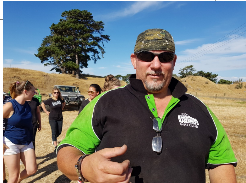
Great to see the Club Shirts out and about and looking fantastic!